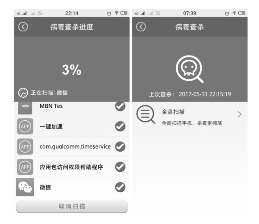
Fig. 3. System interface implementation diagram (Chinese version)

When a user discovers that his cell phone is stolen or lost, he can directly send the appropriate command to the lost phone to remotely control the phone to destroy personal information through the remote command function. Mobile antivirus function is mainly to use Pack Manager to compile all of the program packages in the system. According to compare the package name digital signature of different procedures with the virus digital signature in database, when the match is successful, the program can be identified as a virus program, and then it is unloaded from the mobile phone system. System upgrade function is mainly to conduct the phased upgrade for the anti-virus database information in the system, so as to ensure that the system's virus killing ability can maintain long-term effective. The system interface implementation diagram is shown in Fig. 3.